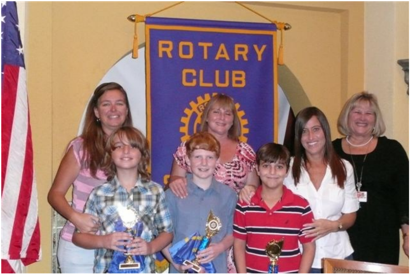
Orange Grove Students of the Month (With Proud Parents)