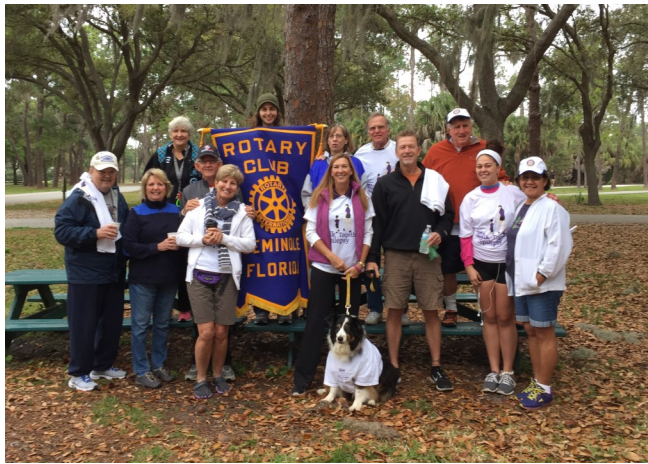
Our Club was well represented at the Epilepsy Walk last weekend!